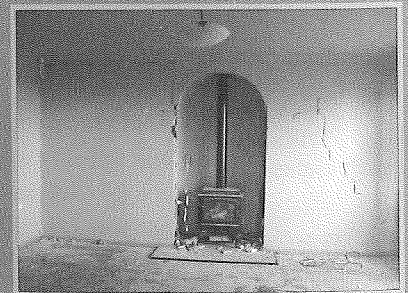
Damage done to Libby's house in the earthquake