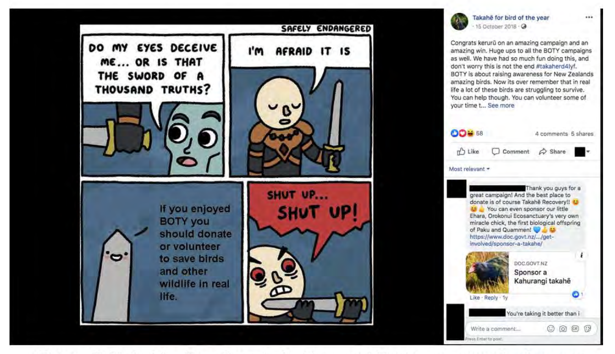
Figure 7. Bird of the Year Sword of a Thousand Truths, an example of memes advocating for political action.

Figure 6 is an example of meme with low barrier to entry for viewers to learn about, care, and potentially enact behavioural change for pro-environmental ends. People who might be otherwise too busy to learn about conservation issues can learn at a glance that tūturiwhatu nest on beaches, that dogs pose a threat to tūturiwhatu, and that a simple solution is to walk dogs on a leash. The standard format of Drakeposting memes provides a script for interpretation (rejecting the first scenario in favour of the second) which allows complex ideas to be conveyed with greater cognitive fluency. Both knowledge and