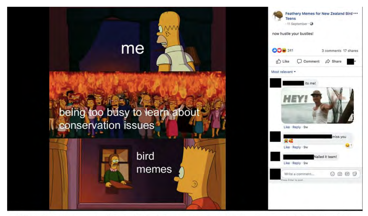
Figure 5. Simpsons Angry Mob meme, an example of memes as an accessible source of information.