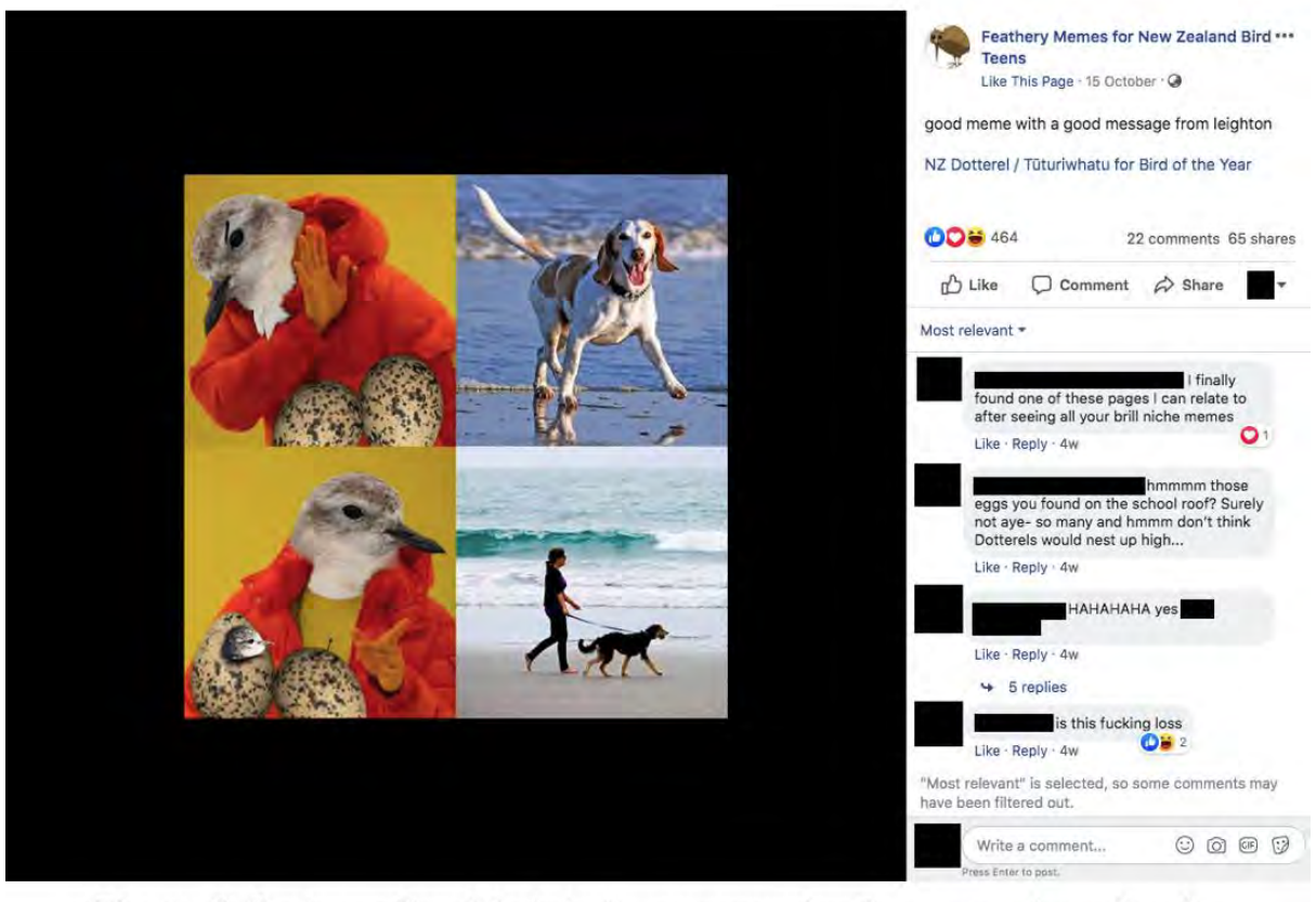
Figure 6. Drakeposting tūturiwhatu, an example of memes advocating for behavioural change.