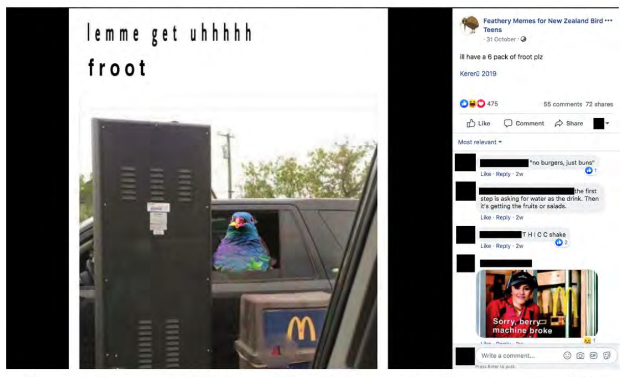
Figure 1. "lemme get uhhhhh froot" Kererū, an example of humorous Bird of the Year memes.

Humorous memes like Figure 1 present native birds as relatable and endearing, offering a light-hearted form of engagement. Birds like the kererū are material for users to make and share jokes (see iteration of further memes in the comment section). By contrast, other memes leveraged humour to make serious points, supporting a