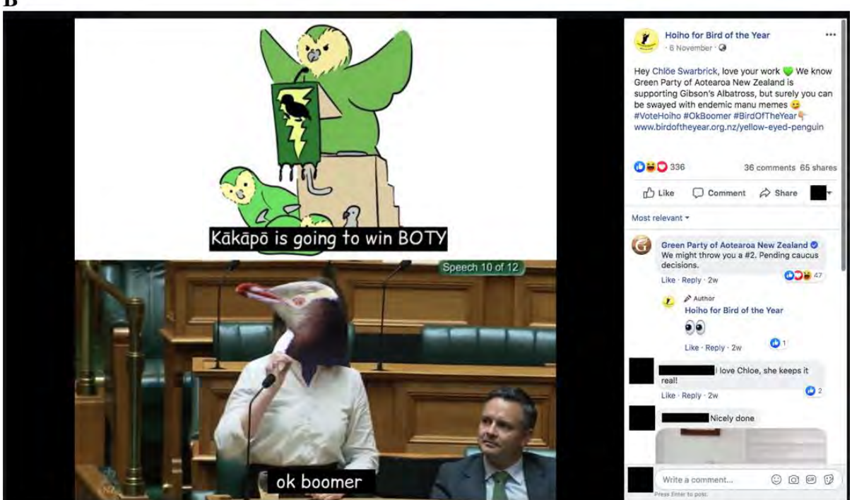
Figure 4. Hoiho macro meme (Panel A) and Ok Boomer Hoiho (Panel B), two examples of memes highlighting similarities between birds and voters.